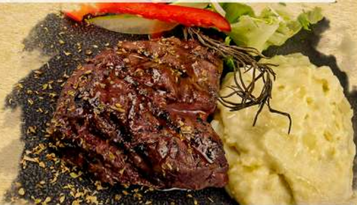
Tenderloin Steak 310.000 Fillet Australian beef tenderloin, with mixed greens