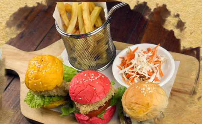
Trio Mini Slider 73.000 Mix of beef, chicken and fish served with French fries