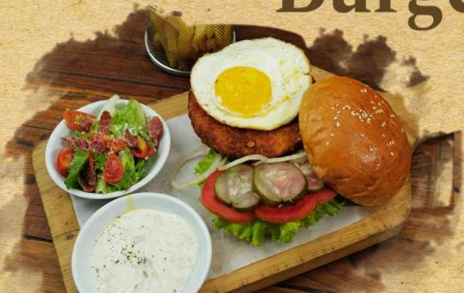
Crispy Chicken Caesar Burger 81.000 Deep fried chicken burger served with French fries