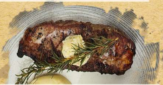
Sirloin Steak 243.000 Fillet Australian sirloin beef with green salad and black pepper sauce