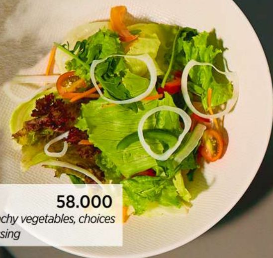
Garden Salad 58.000 Tossed salad made with fresh crunchy vegetables, choices of vinegrate/ thousand island dressing