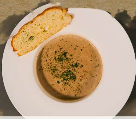
Healthy Creamy Mushroom Soup 52.000 Champignon, shiitake mushroom, truffle oil served with homemade garlic crouton