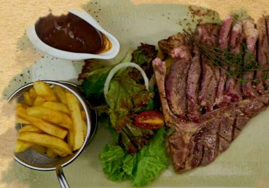
T - Bone 300 gr 345.000 Well-marbled cut consists of two lean, tender steaks - the strip and tenderloin - connected by a telltale T-shaped bone, served with Green Salad