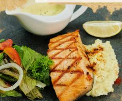
Grilled Salmon 243.000 Fillet Norwegian salmon brushed with herbs oil and vegetable and lemon butter sauce