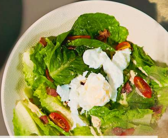
Caesar Salad 88.000 Romaine lettuce bacon and poached egg, anchovies dressing served with garlic bread