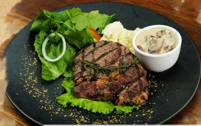
Rib Eye 243.000 Fillet Australian rib eye beef, with mixed greens