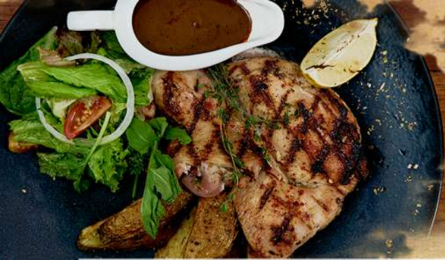
Grilled Chicken 123.000 Marinated chicken with herbs, spices and olive oil