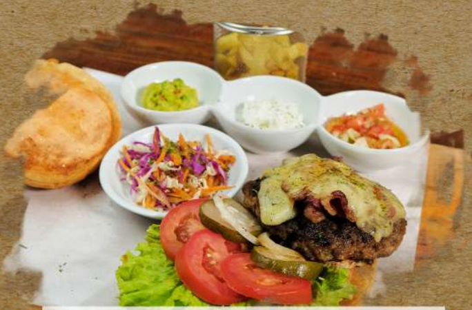
Tex Mex Burger 110.000 Beef patty with avocado, bacon, tomato salsa and homemade sour cream served with French fries